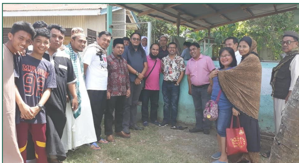
Figure 2 : Zamboanga residents (both Christian and Muslim) gather at the Al-Islam Mosque after completion of the Friday Unity Prayers