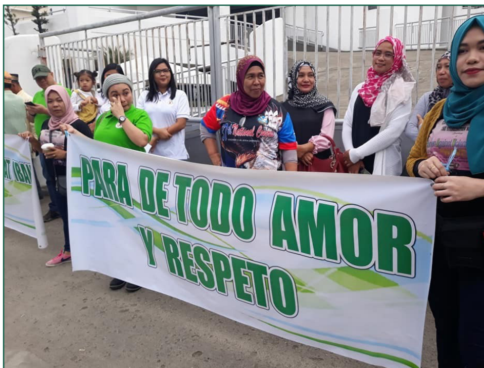
Figure 6: Women, men and children from TSN's WAVE network provide the symbolic guard outside the Metropolitan Cathedral, Zamboanga City, Sunday 3 February. The banner states 'Peace and Respect for All'.

The success of a plebiscite held on January 21 to create a Bangsamoro Autonomous Region in Muslim Mindanao (BARMM) improves the chances for peace and countering violent extremism in the southern Philippines. Any major setback to the peace process in Muslim Mindanao as a result of tit-for-tat terrorist attacks against Christian and Muslim communities—given BARMM is the culmination of more than two decades of negotiations—would almost certainly trigger discord in the Moro nationalist movement and strengthen the hand of violent extremist groups, some of which are aligned to Islamic State.